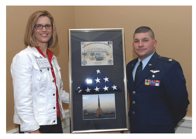
Hoover and Boackle

Boackle returned home last fall after a four-month deployment to